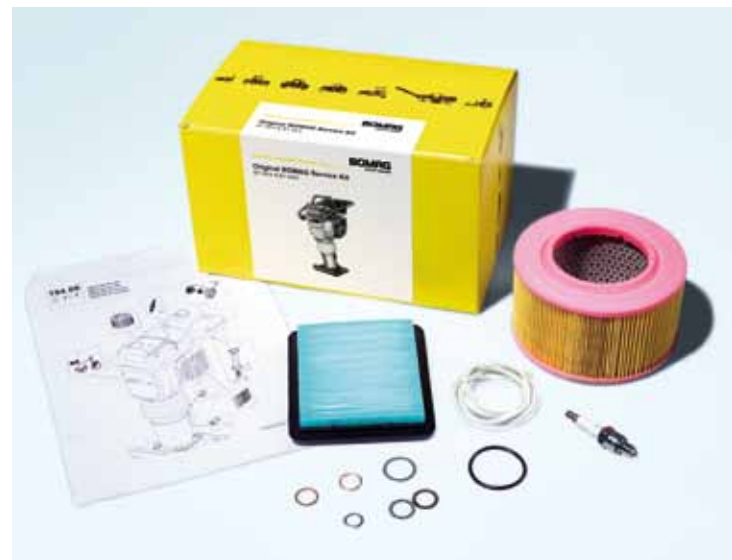
BOMAG service kits save time and money.

The optional BOMAG service kits provide all the parts needed in one box. This saves time and money.