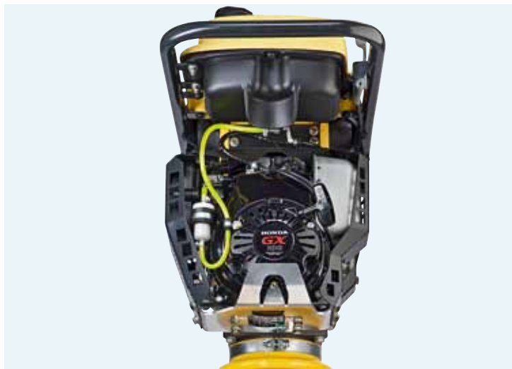
Two-stage fuel filter system for optimum reliability.