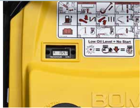
Hour counter and tachometer with service display for regular service planning.