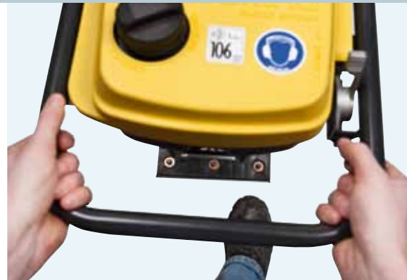
Fatigue-free, accurate work thanks to easy handling and low hand-arm vibrations.