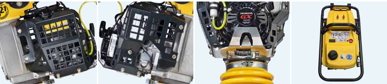
The all-round engine protection stops site damage.