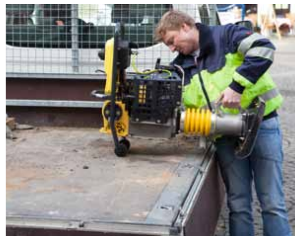
Transport rollers for easy loading.

The large, robust single lifting point means the unit can be transported safely and loaded easily using an excavator, crane or forklift. The rollers on the steering bow are a useful aid for loading. Additional transport wheels are optionally available to make transport on-site easier.