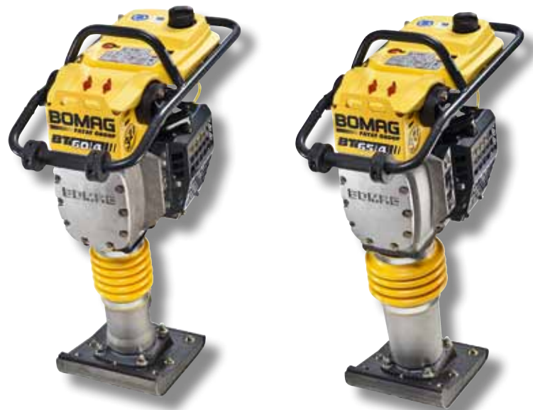
BOMAG tampers BT 60/4 and BT 65/4 with 4-stroke petrol engine.