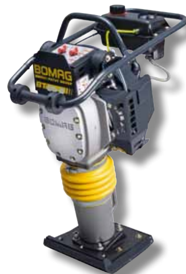
BOMAG tamper BT 80 D with diesel engine.