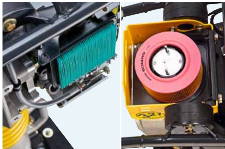
Two-stage double air filter system for complete reliability.

An automatic oil level check prevents the petrol engine from starting if the oil level is low. This protection guarantees a long service life especially for irregular work patterns typical with tampers and the short periods of use. A red flashing LED signals to the operator before start-up that the oil level requires attention.