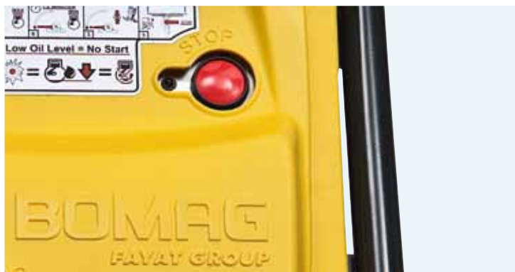
Automatic oil level check with warning LED for maximum service life.