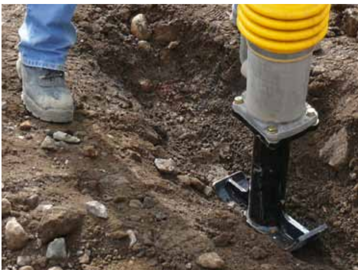
Choice of pad foot widths (optional) for greater flexibility.