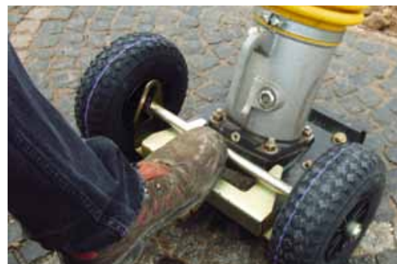
Transport wheels (optional) for easy transport on-site.