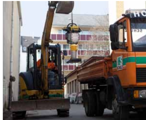
A stable single lifting point for secure transport.